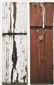
Joinery Quality Nordic Pine

Accoya wood has shown improved coating lifetime performance with many types of coatings, resulting in extended maintenance intervals. The light colour of Accoya wood allows for a wide range of colour finishes. Due to its stability, Accoya wood significantly prolongs the life of film-forming coatings greatly extending maintenance regimes and enabling windows to remain looking pristine for many years. Accoya® wood is easier to coat, less preparation and sanding is required.